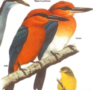
Micronesian Kingfisher Todiramphus cinnamomina Endemic Subspecies Silek (CNMI, Guam) Wazw (Carolinian)