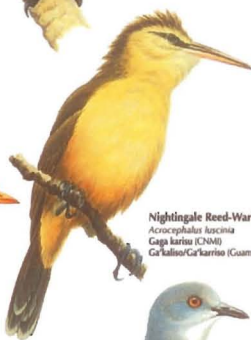
Nightingale Reed-Warbler Acrocephalus luscinius Gaga karrio (CNMI) Ga'kallio/Ga'karrio (Guam)