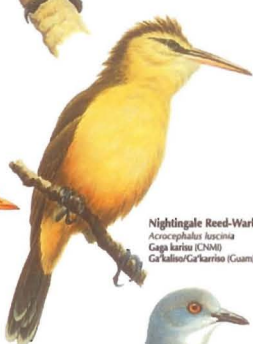
Nightingale Reed-Warbler Acrocephalus luscini Gaga kariso (CNMI) Ga'kalis/Ga'kariso (Guam)