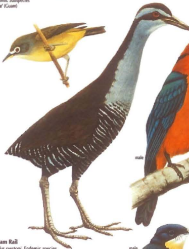
Bridled White-eye (Guam) Zosterops conspicillata conspicillata , Endemic Subspecies Nasa' (Guam)