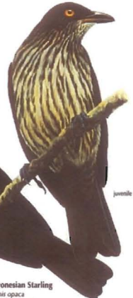
Micronesian Starling Agelaius agaya Sali (CNMI, Guam) Meli (Carolinian)