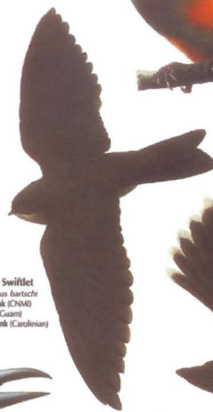
Mariana Swiftlet Aerodramus bairdii Chuchupak (CNMI) Yapagwak (Guam) Leghe'yayank (Carolinian)