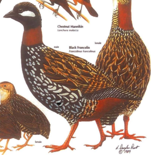
Black Francolin Francolinus francolinus