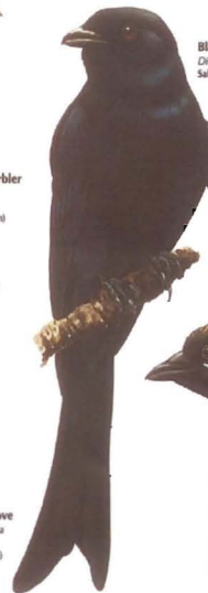
Black Drongo Dicrurus macrocerus Sali Taiwan (CNMI, Guam)