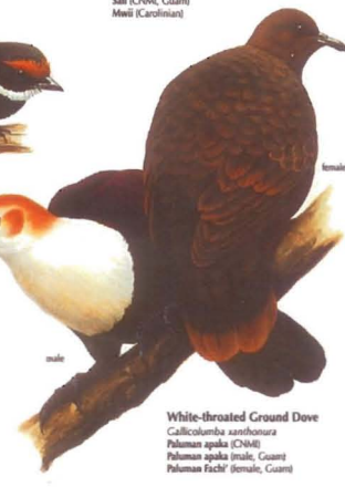
White-throated Ground Dove Calocolumba sanctumana Pulaman apaka (CNMI) Pulaman apaka (male, Guam) Pulaman fachi' (female, Guam)