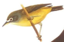
Bridled White-eye (Guam) Zosterops conspicillata conspicillata , Endemic Subspecies Nasa' (Guam)