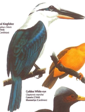
Collared Kingfisher Todiramphus chloris Silek (CNMI) Waww (Carolinian)