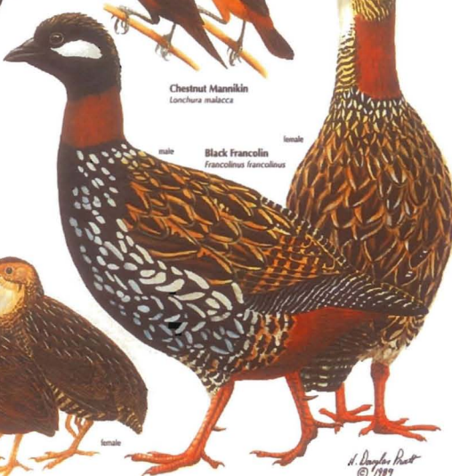
Black Francolin Francolinus francolinus