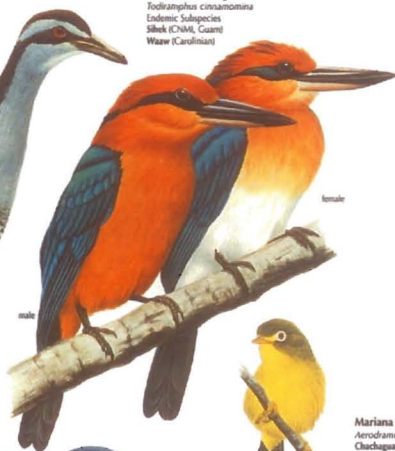
Micronesian Kingfisher Todiramphus cinnamomina Endemic Subspecies Silek (CNMI, Guam) Waww (Carolinian)