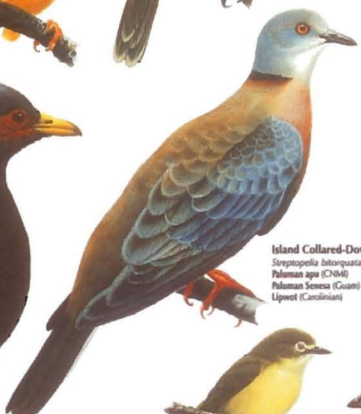
Island Collared-Dove Streptopelia interpres Pulaman apa (CNMI) Pulaman Senesa (Guam) Lipwet (Carolinian)