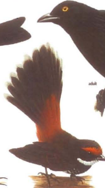
Rufous Fantail Rhipidura rufirostris Nasaak (CNMI) Chichirika (Guam) Liohli' par (Carolinian)