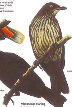
Micronesian Starling Agelaius opaca Sali (CNMI, Guam) Meli (Carolinian)