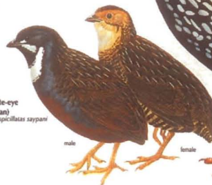
Blue-breasted Quail Coturnix chinensis Bengheng (Guam)