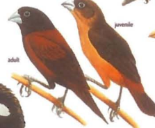
Chestnut Mannikin Lonchura malacca