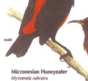
Micronesian Honeyeater Myzomela rubra Egig (Guam)