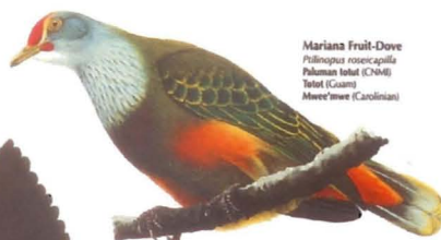
Mariana Fruit-Dove Ptilinopus roseicapilla Pulaman totot (CNMI) Toto (Guam) Mwee'mwee (Carolinian)