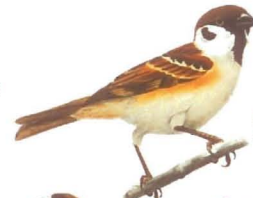
Eurasian Tree-Sparrow Passer montanus Ga'ga' pale' (CNMI)