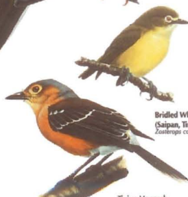
Bridled White-eye (Saipan, Tinian) Zosterops conspicillata saipani