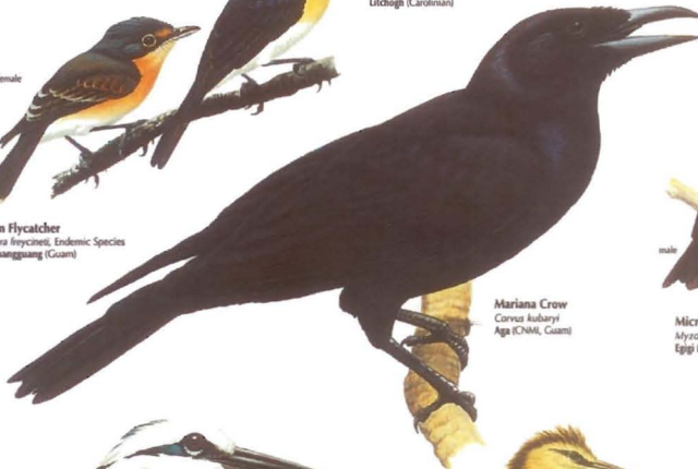
Mariana Crow Corvus kubaryi Aga (CNMI, Guam)