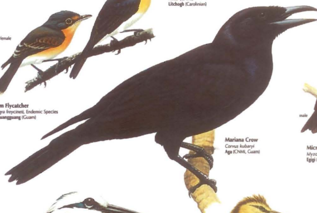
Mariana Crow Corvus kubaryi Aga (CNMI, Guam)